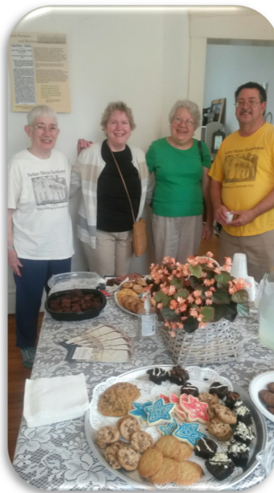
Board members toured visitors