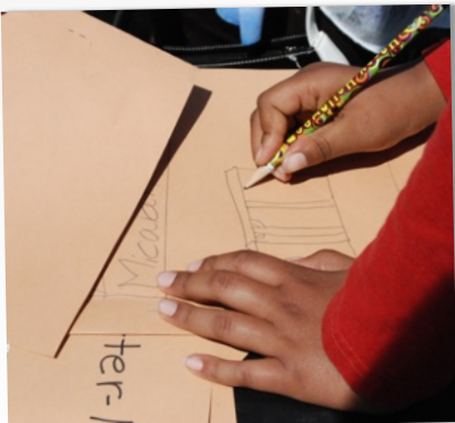
SKETCHING THE FARM HOUSE

furniture were ideas the 4th graders thought would be fun as well as educational. In early May the students and teachers took a field trip to Sutter-Meyer farmhouse, where they toured the house, made books, and played old fashioned games. The 4th graders had a great time trying the 3-legged races!