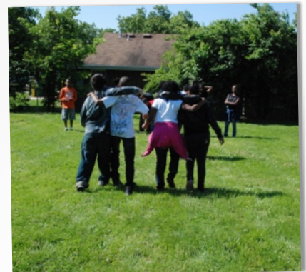
PLAYING COOPERATIVE GAMES